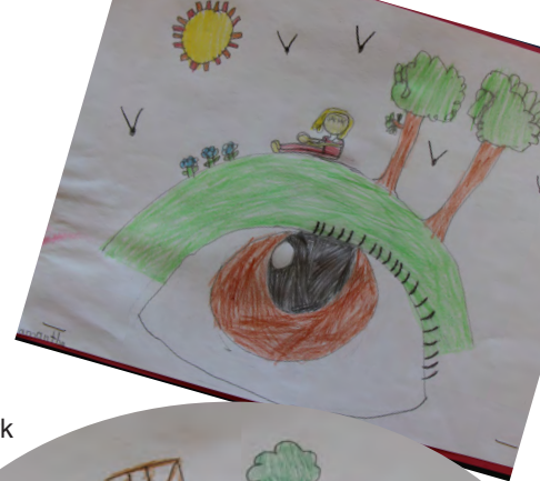
Grade 2 Artwork

The entire student body and all staff are challenged to work together to create a positive environment in the classrooms and on the playground. Using Jesus as the example of how to live our lives, provides us with the perfect role model to imitate. •